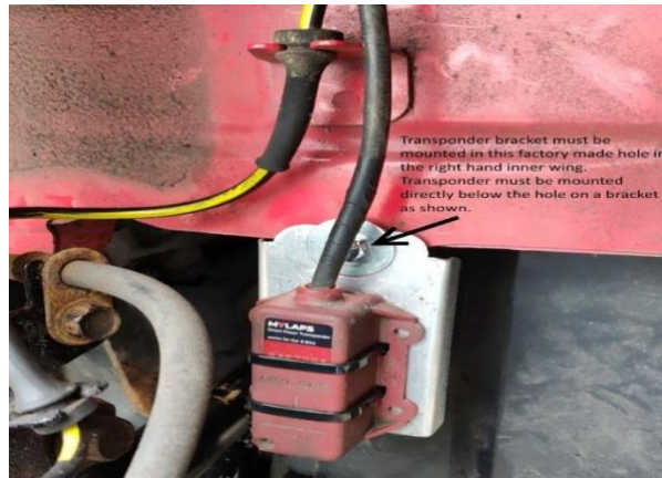
See 14.1.2 for wiring regulations.

5.6.3.13 The mandatory TSL lap timing transponder must be fitted to the front inner (right side) flitch panel in the position shown below: