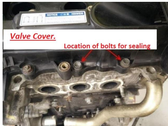
Photograph shows the location of the valve cover bolts.

To allow a Motorsport UK Scrutineer or C1 Club Racing the option for an engine to be sealed prior to inspection, Two bolts at the front of the valve cover must be cross drilled or replaced by competitor supplied drilled bolts. These two valve cover bolts may be wired together and sealed by a Motorsport UK Scrutineer or their appointed assistants (Motorsport UK General Regulation G.1.1.2), or by C1 Racing Club personnel in relation to fitment of C1 Racing Club seals (5.2.2.5 - 5.2.2.6). The engine will be made available for inspection at any future time as specified by the Motorsport UK scrutineer, or in relation to C1 Club seals, as requested by the C1 Racing Club.