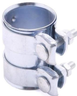
Universal Exhaust Pipe Sleeve Clamp

The overall length/bore of the exhaust centre pipe must not be altered. It is permitted to use a Universal Exhaust Pipe Sleeve Clamp as shown below or make a slip joint.