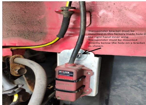
See 14.1.2 for wiring regulations.

5.6.3.13 The mandatory TSL lap timing transponder must be fitted to the front inner (right side) flitch panel in the position shown below: