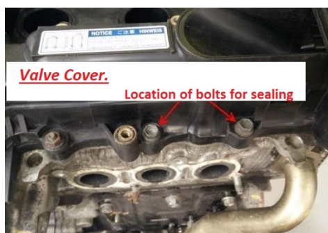
Photograph shows the location of the valve cover bolts.

UK Scrutineer or their appointed assistants, or by C1 Racing Club personnel in relation to fitment of C1 Racing Club seals (5.2.2.5 - 5.2.2.6). The engine will be made available for inspection at any future time as specified by the Motorsport UK scrutineer, or in relation to C1 Club seals, as requested by the C1 Racing Club.